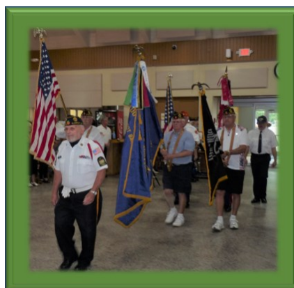
Barefoot Bay's very own American Legion Post 366.

Services will be Friday, November 11th, "under the oaks" just east of the Administration Building. The traditional golf cart parade will step off from the tennis courts at 10:45am and proceed to the natural amphitheater east of the Administration Building for an 11am service. There will be a decorate your golf cart contest with gift card prizes. Judging at the tennis courts starts at 10:15am. Hot dogs and light snacks will be provided after the service.