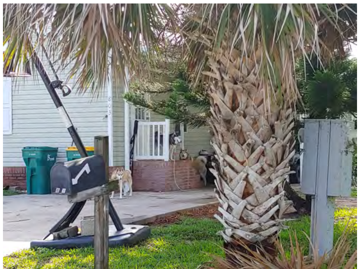
803 beech 3 dogs Stephane Fecteau Jun 10, 2019