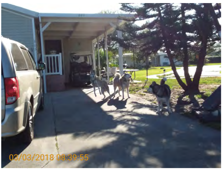
803 Beech Stephane Fecteau Mar 03, 2018