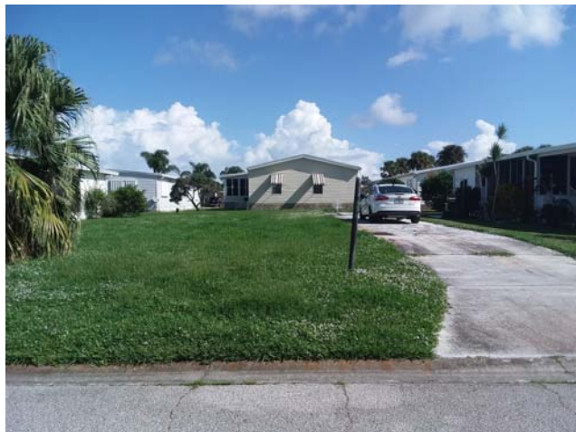
915 Oriole. Lawn and landscape: high grass Nov 07, 2019