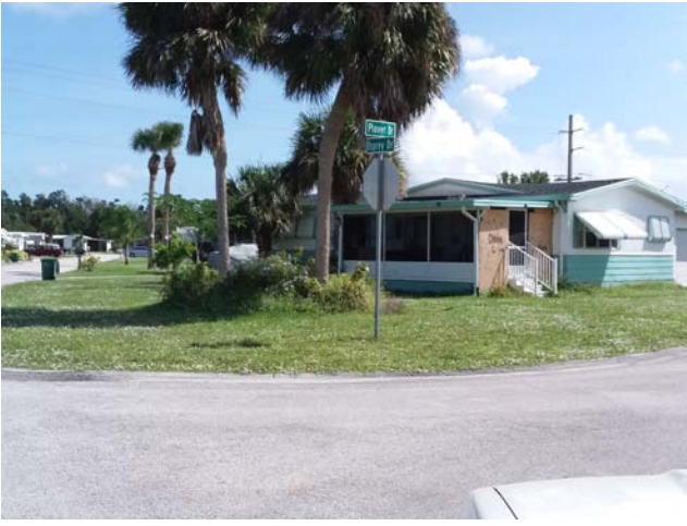
444 Plover. High grass, weeds. Oct 30, 2019