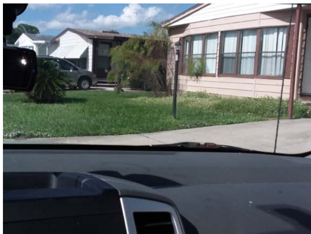
516 Egret. High grass, weeds. Nov 12, 2019