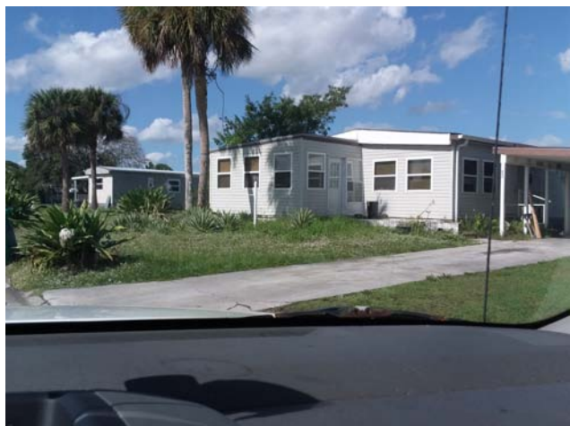
400 Raven. High grass, weeds. Nov 12, 2019