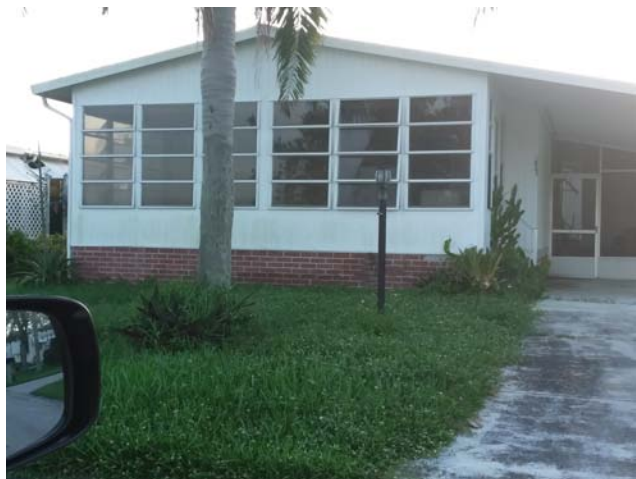
823 Wren. Lawn and landscape: high grass Nov 08, 2019