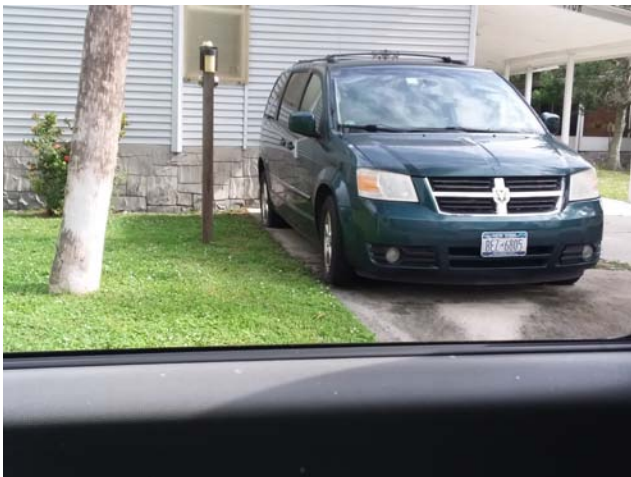
1108 Indigo. Inoperable vehicle (flat tires). Nov 04, 2019

Violations Committee/Deed of Restrictions Staff