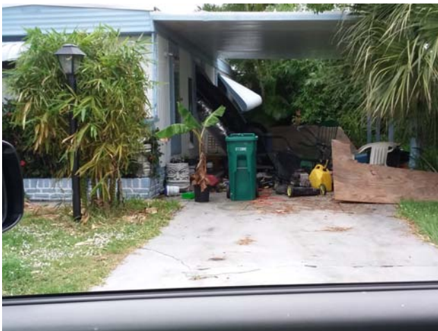
890 Pecan. Unapproved items/debris Nov 04, 2019

Violations Committee/Deed of Restrictions Staff