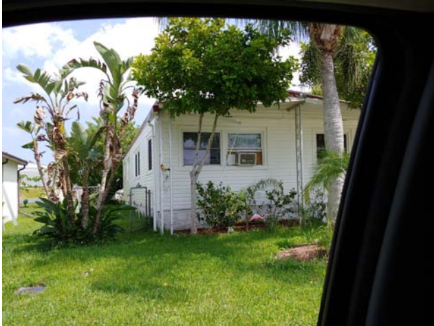
915 wren Stephane Fecteau Sep 07, 2019