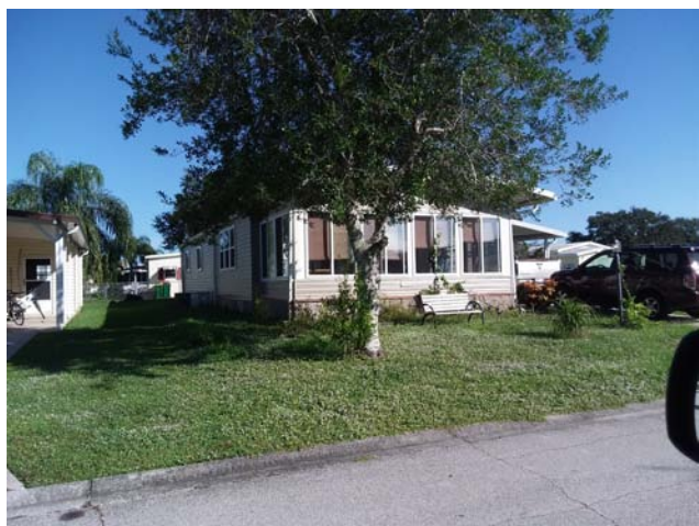
1016 Wren. Lawn and landscape: high grass Nov 12, 2019