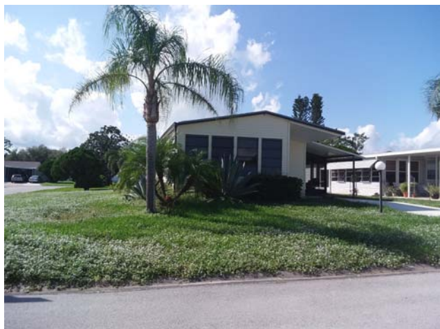
701 Bougainvillea. Lawn and landscape: high grass Nov 07, 2019