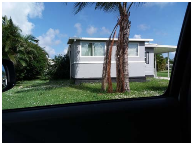
916 Pecan. Dead palm fronds. Oct 30, 2019