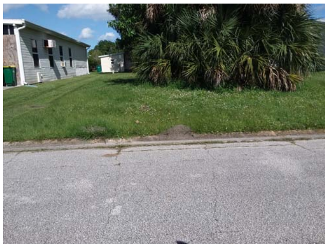
822 Vireo. High grass. Nov 12, 2019