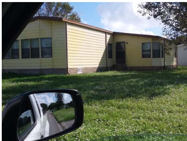
1376 Barefoot. Lawn and landscape: high grass Nov 07, 2019