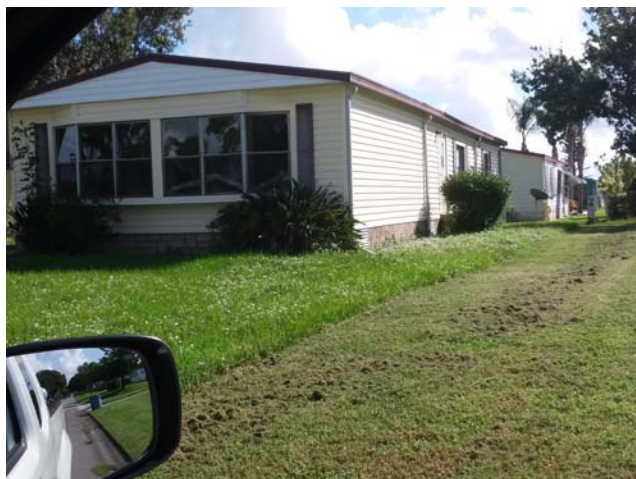
1374 Barefoot Cr. Lawn and landscape: high grass Nov 07, 2019