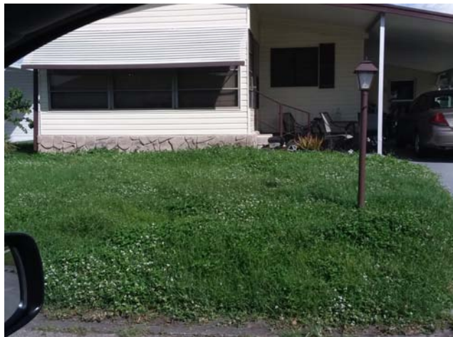
1050 Thrush. Lawn and landscape: high grass Nov 07, 2019