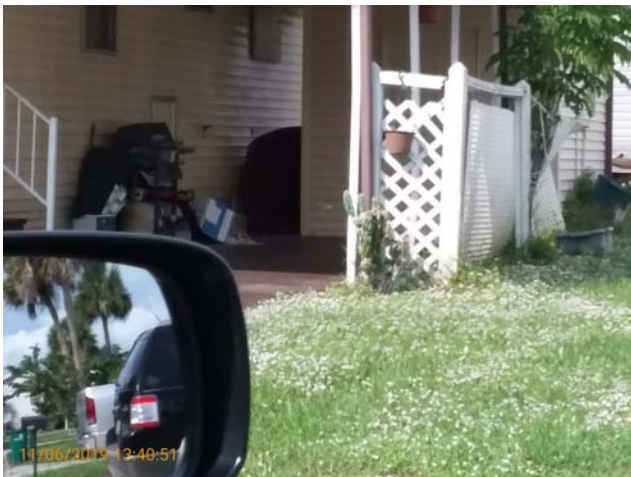
855 Hawthorn. Unapproved item(s) in breezeway. Nov 06, 2019

Violations Committee/Deed of Restrictions Staff