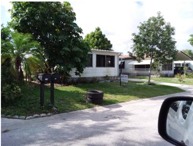
856 Pecan. Debris in yard (tires)

Violations Committee/Deed of Restrictions Staff