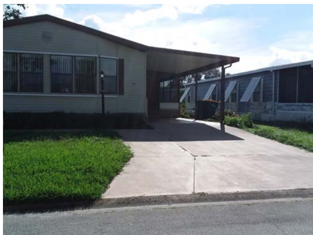
811 Periwinkle. Lawn and landscape: high grass Nov 12, 2019