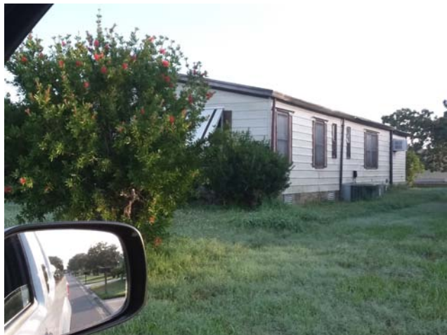
892 Waterway. Lawn and landscape: high grass Nov 08, 2019