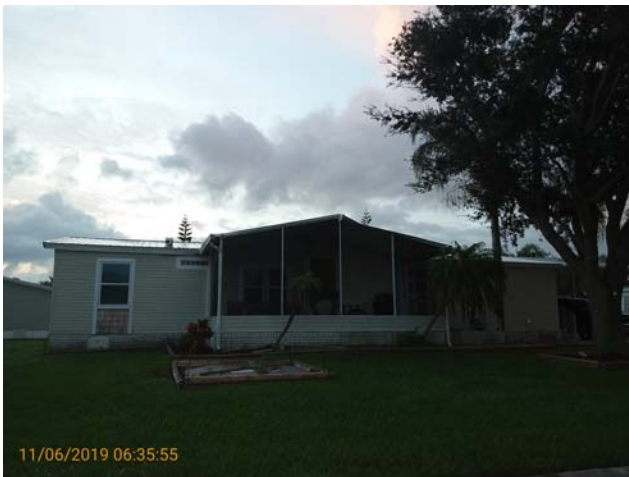
1217 Bluebird. Porch screen / roof pans Nov 06, 2019

Violations Committee/Deed of Restrictions Staff