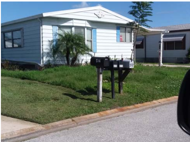
512 Puffin. High grass. Nov 12, 2019