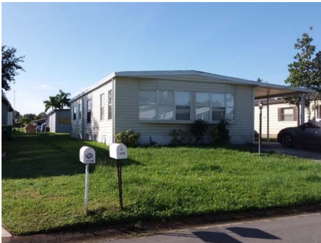
1057 Manila. Lawn and landscape: high grass Nov 12, 2019