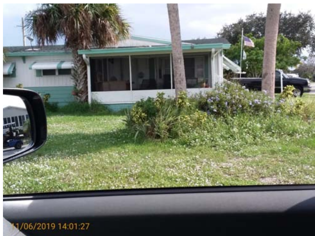
444 Plover. High grass, weeds. Nov 06, 2019