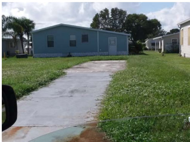
623 Hyacinth. Lawn and landscape: high grass Nov 07, 2019