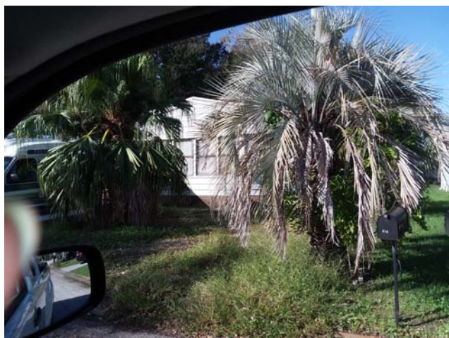
609 Wedelia. Lawn and landscape: high grass/weeds Nov 12, 2019