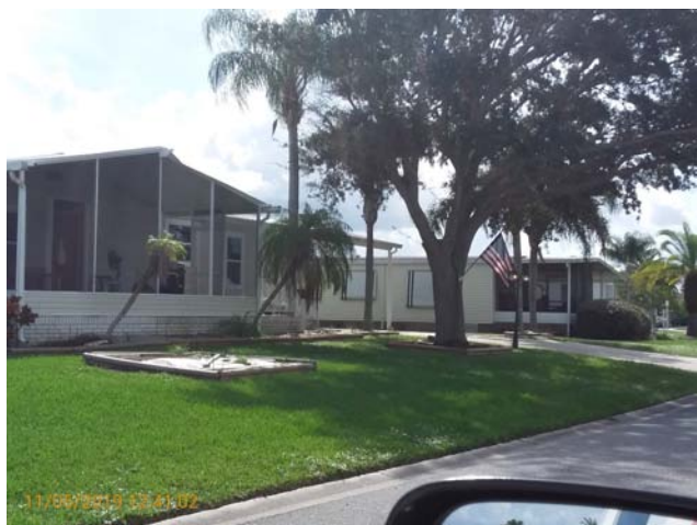
1217 Bluebird. Raised garden beds, exceeding 40 square feet in total. Nov 05, 2019